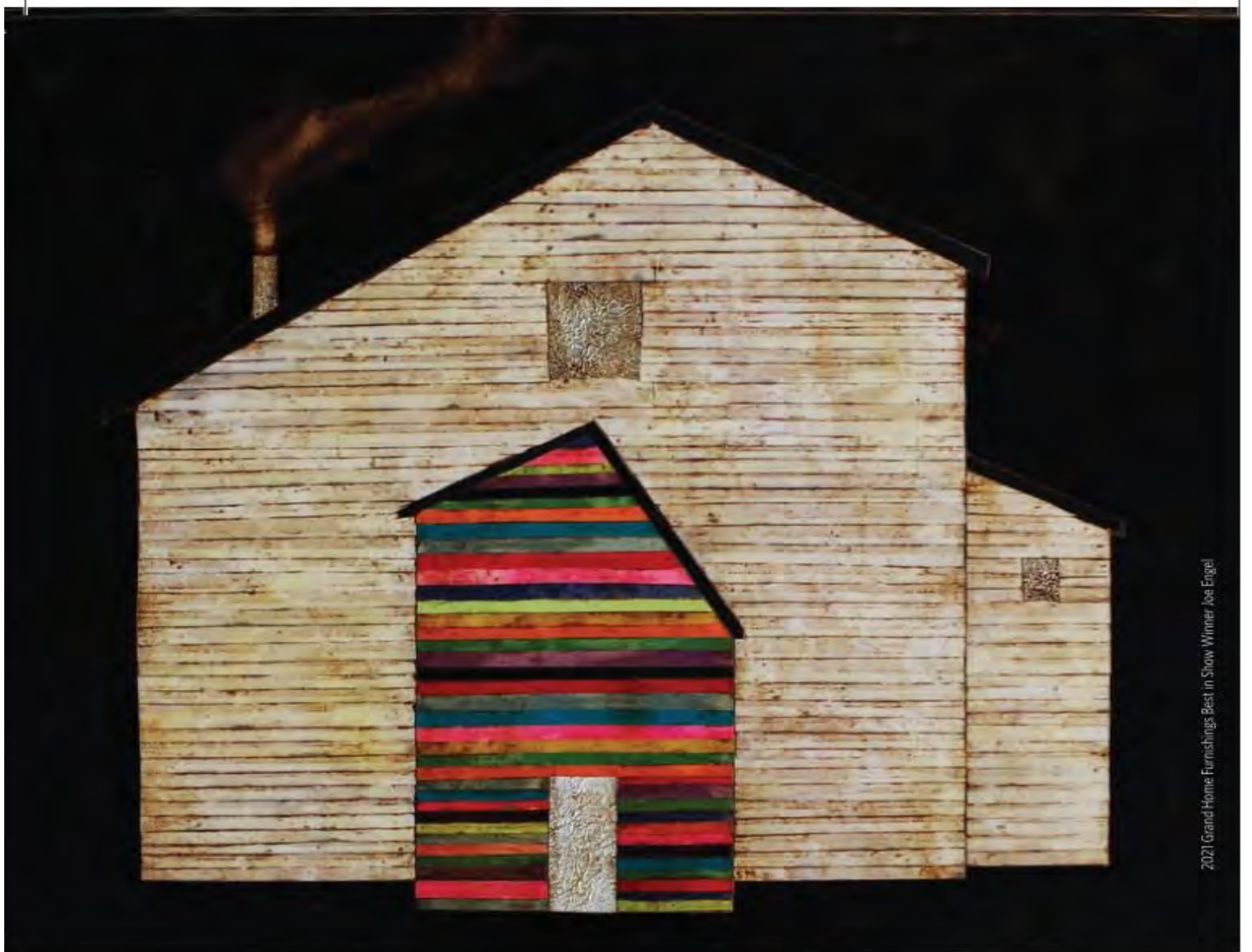
2021 Grand Home Furnishings Best in Show Winner Joe Egge